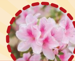
AZALEAS and RHODODENRONS