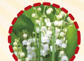
LILIES/LILY OF THE VALLEY